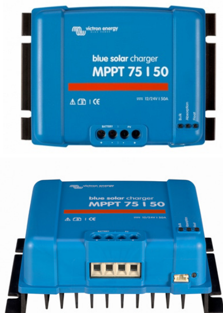
Solar charge controller MPPT 75/50